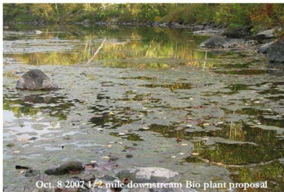
Figure 3 Westfield River, October 8, 2007

Flow at the project site on the picture date of October 8, 2007 (calculated as the summed flow of the three upstream branches, adjusted upward to reflect additional watershed area not included in gauged data) was 35.1 cfs, slightly higher than the 32.4 cfs 7Q10 flow calculated by the proponent. Along with illustrating what a flow in the mid-30's cfs actually looks like, these pictures of the Westfield River clearly show extensive algal